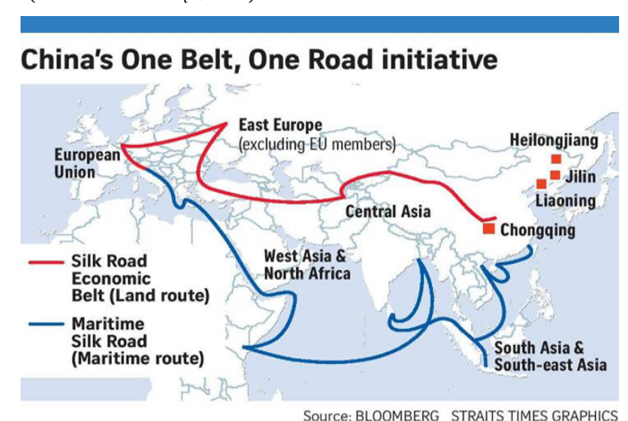
Figure: Map showing China's One Belt, One Road Initiative

BRI consists of two mega projects: Silk Road Economic Belt and a New Maritime Silk Road. These two projects were unveiled and inaugurated by President Xi in September 2103 in Kazakhstan and October 2013 in Indonesia respectively. These potential notions paved the way for an inclusive, mutually beneficial and cooperative ventures of land and sea-based economic and trade corridors connecting Asian with the Eurasian and European markets (Swaine, 2015). Under BRI, China has endeavoured to build a web of roads and railway networks along with pipelines, fibre optics and communication networks across the 11,000 km of the Eurasian continent (Farwa & Siddiqa, 2017, p. 83). Another part of the BRI, 'the 21st Century Maritime Silk Road' has envisioned to connect China with the seashores of major regions like South East Asia, South Asia, North Africa, Middle East and Europe through sea passages of South China, Indian Ocean, Arabian Sea and the Mediterranean Sea (Farwa & Siddiqa, 2017).