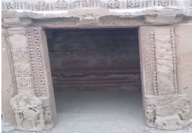
Image 14: (Bodhesar): Main Entrance of Jain Temple-III, Shown Idols

small idols are there with floral designs whereas the top right idols have vanished (Pl: XIV).