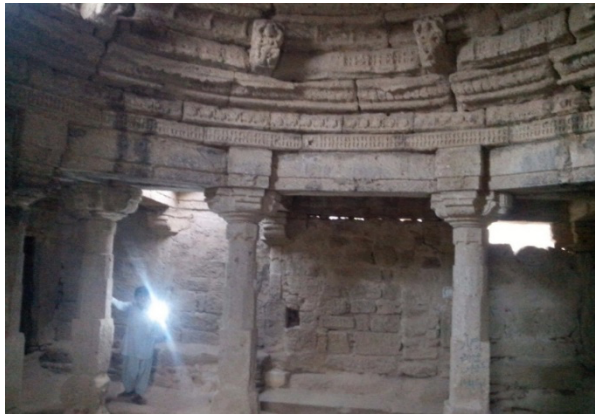
Image 11: (Bodhesar): Tapered Idols on main hall beams of Jain Temple-II

The niche of the door is made up of red sandstone with beautiful geometrical designs and idols. The main hall entrance approach through a flight of ten steps. The main hall is planked by small garbhagriha's for worship. The columns and beams are carved with images and geometrical designs (Pl: XI).