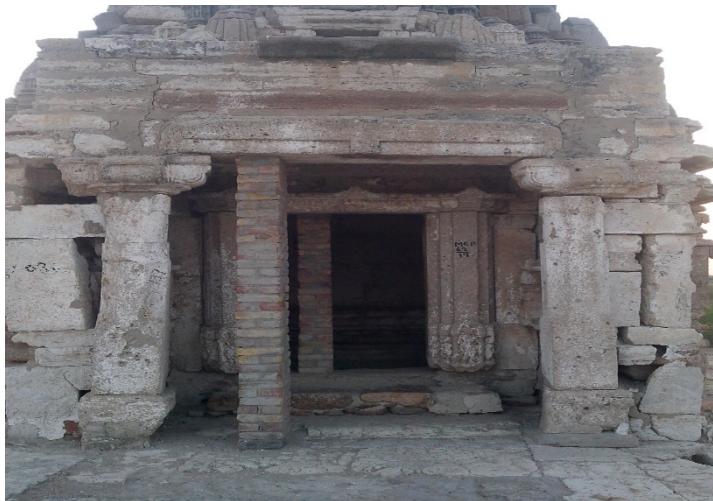
Image 10: (Bodhesar): Main Entrance of Jain Temple-I and Extra Support to the Beam

of Jain architecture. The falling building of a temple is supported by two bricks columns which are not enough for the complete support (Pl: X).