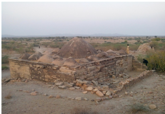
Image 12: (Bodhesar): from the South-West Corner of Jain Temple-II

Along with the centred soffit of shakara, ten small domed roofs represent the side cells (Pl: XII).