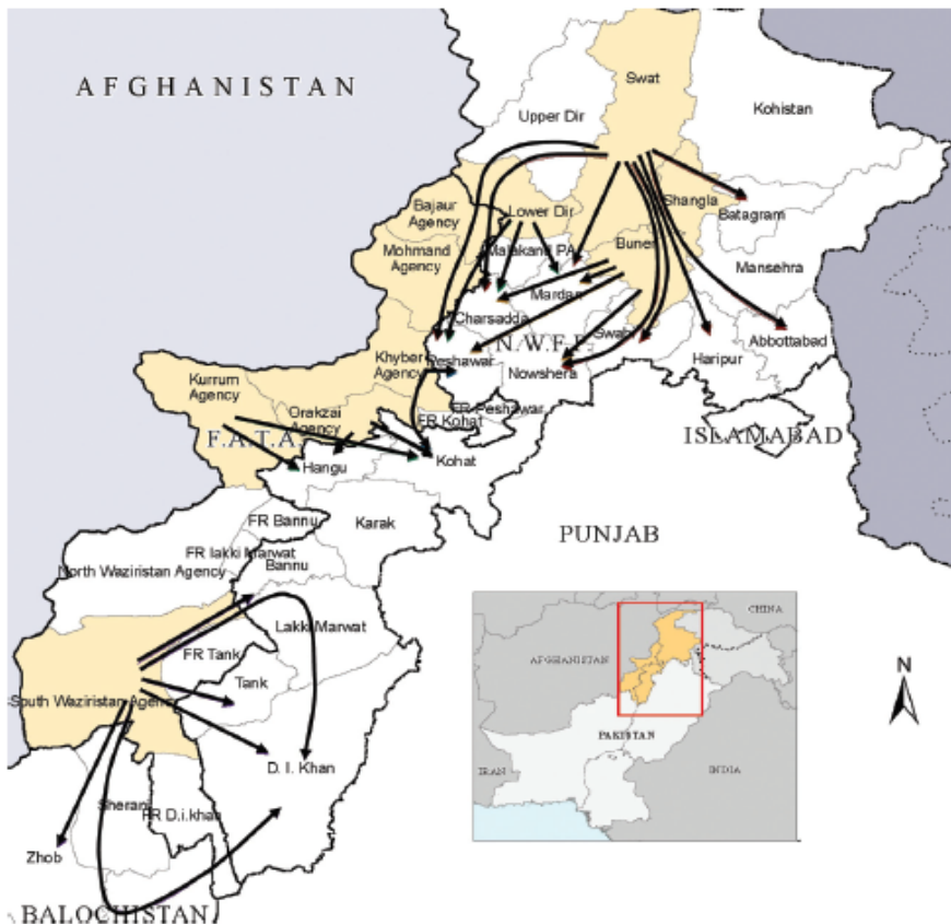
Figure: The movement of conflict-induced IDPs from the settled and tribal districts of Khyber Pakhtunkhwa province (Bile et al., 2010).

At the time of the study, 3,770 IDPs families were residing in the Jalozai camp (Mohsin, 2013).