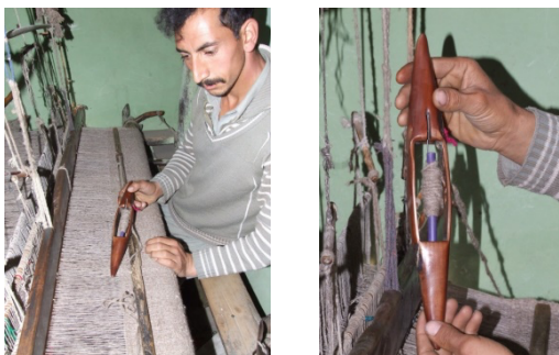
Figure 12a & b: Shows the Kiribang Process on Thaqsha

iii. Tia ma (beating up): In this process a “tiag shing” wooden reed was used to push the weft up against the fell of cloth. This was very important step in weaving of the pattu fabric. The quality of fabric