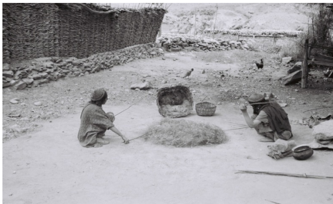
Figure 3: Females are Rdaphing the Wool

from dirt. The stick used in rdaphing should be elastic and smooth so the wool might not stick with it while coming out of the heap. When the stick was beaten on the wool, it should not be picked straight rather it should be pulled towards oneself. The stick is known as “Dapshing” which generates a beautiful sound while beating the wool. The process is shown in figure 3.