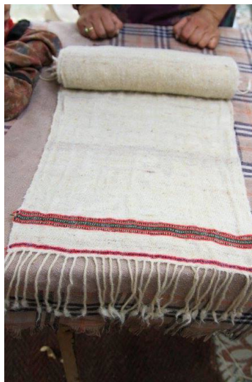
Figure 17: Traditional Karr prepared by pattu.

this fabric was thick. The fabric made by this yarn was very warm and was especially well suited for the cold climate of the local area. In figure 17 traditional winter wearing Karr is shown.