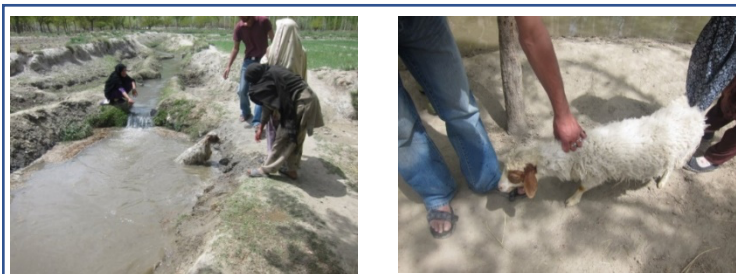
Figure 2: Shows Sheep are Washed and Ready for Braqpa

Braqpa: First, the sheep were washed so the major impurities may filter out and good wool could be acquired from the sheep. Then the sheep was sheared (the process of removal of fleece from sheep), which is known as braqpa. As shown in figure 2, the sheep is washed and is ready for shearing or braqpa.