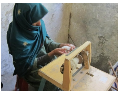
Figure 5: A female is working on phang (source: BCDF).

5 shows a female is working phang (source: BCDF).