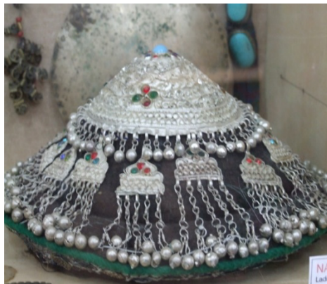
Figure 15 A & B: Traditional natings made by Pattu (Source: Author).

The cap shown in figure no 16 is very useful for children in extreme weather as it covers not only head but ears and back of neck as well.