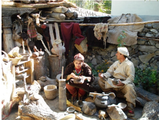
Figure 14: Traditional Dress made by Pattu.

colors were black, red and blue. Figure 14 shows traditional Balti dress for men and women. This style of winter dress has been abandoning or is very rare in Baltistan now days.