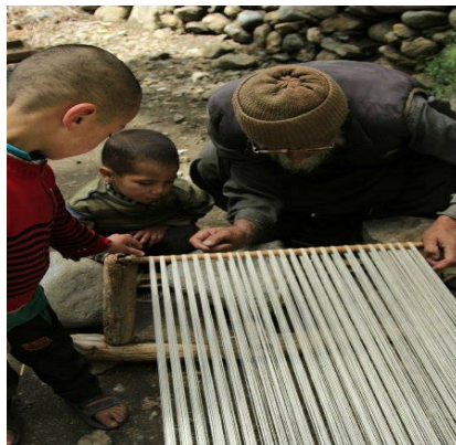
Figure 8: Shows an old Man Working on the Model of Ribanma

Was a Process of Reeling the Yarn on the Loom or Thaksha (see figure 8 for Illustration)