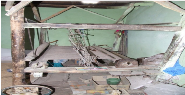
Figure 10: Shows a Traditional Thaqsha

compare to the spul. Second, the “spul” (weft) yarn which crossed the warp yarn at right angle to fill the gaps between the warp to make fabric. Single warp thread was called reng e suktpa which is commonly known as “end” and single weft thread was called phrath e suktpa, which is in general known as “pick”.