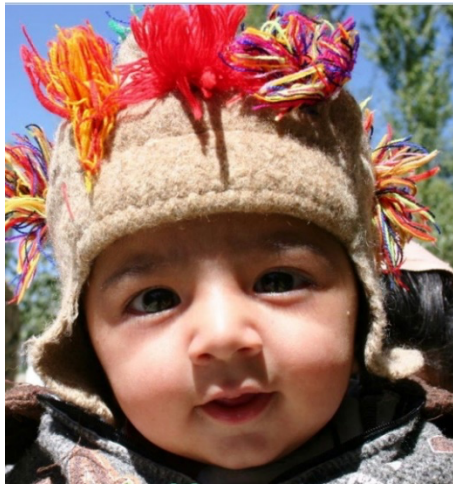
Figure 16: Traditional Nating by Pattu.