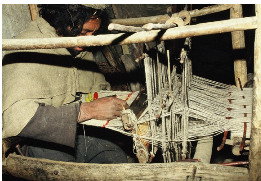
Figure 13: Shows a Man Weaving on Thaqsha

was very much dependent upon the proper adjustment and setting of this step, as it was related to the looseness and stiffness of the fabric.