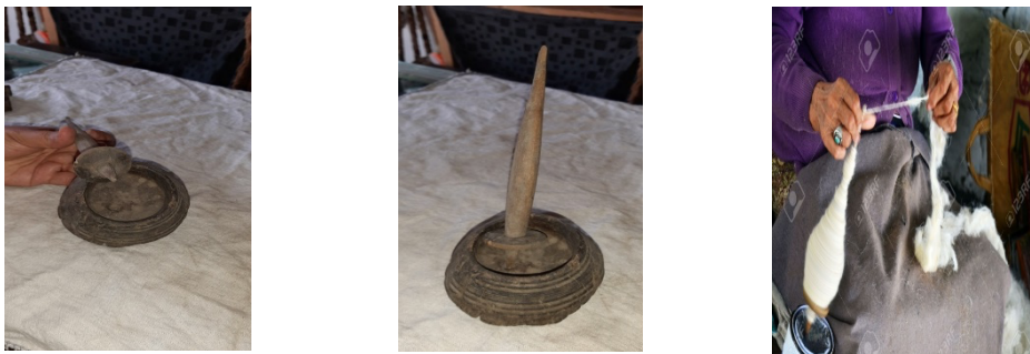
Figure 4a. 4b & 4c: Shows Phangshing and Phangoxia while in Fig 4 c a Woman is Working on it

Later on, in 1970s a machine was invented to be used for this process, which made the process easier and less time consuming. Figure