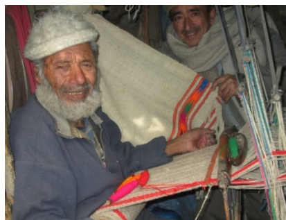
Figure 9A & B: Shows Men Working on the Balti Thaqsha