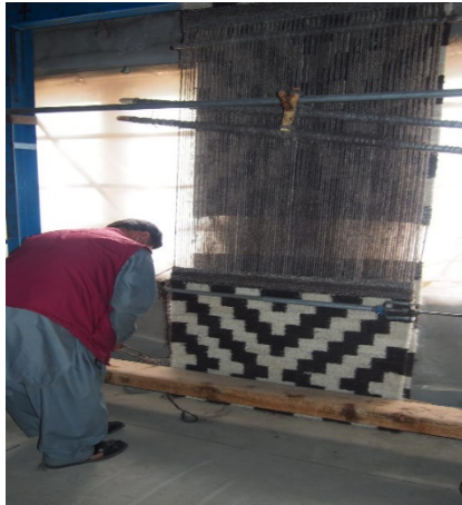
Figure 18: Traditional Charra made by Pattu Wool.