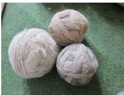
Figure 6: Shows the Ball ready after Spinning

weaving process. This was known as “Throw”. Figure 6 shows that the yarn is ready for weaving.