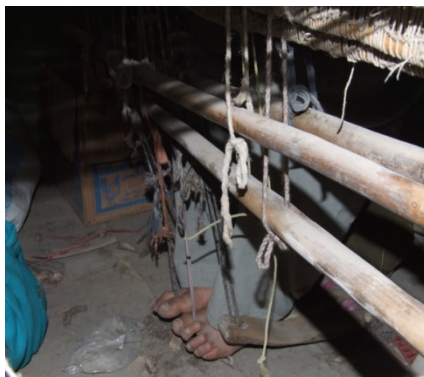
Figure 11: Shows the Kiribang Process on Thaqsha

pushing strings down by foot this process is known as “kiribang”. In this the upper group is moved down and lower group is moved up. Creating a space made the next step easier in which rgom phru or shuttle is passed through the gap, which was created between the two groups. Fig no 11 illustrates the kiribang process.