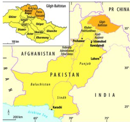
Figure 1: Gilgit-Baltistan Satellite Image

Baltistan is located in the northern region of Pakistan, and it is one of the aesthetically beautiful and natural heritage regions of Pakistan, having the highest mountain peaks such as mighty K-2 and Nangaparbat, the killer mountain (Afridi, 1988). The famous land of Baltistan is hemmed in all sides by astounding mountain ranges that stand resembling white giants of un-proportioned heights (Baloch, 2004). In Baltistan, people have seen the survival of many languages, cultures and civilizations that have been lost somewhere in the rapidly changing dynamics of the world. Northern areas of Pakistan have opened a new approach to history for discovering the lost human links and exposing the cultural heritage of the region (Dani, 1989).