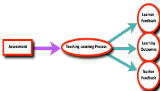
Figure 4: Assessment Model (Based Broadfoot and Black 2004)

Broad foot and Black (2004) Designed an assessment model that promotes learning, offers input on learning and teaching for each learner and teacher and produces learning outcomes.