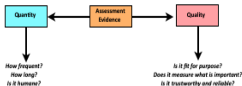
Figure 2: Quality and Quantity (Ud-Din, 2015).

Two keywords are important: quantity and quality: