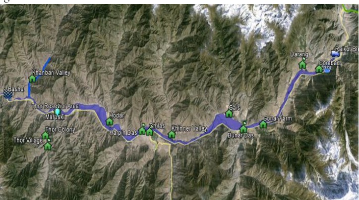
Figure 3. Land acquisition/affected areas

The areas which are going to be submerged and where the necessary land acquisition process in progress is shown in the figure below