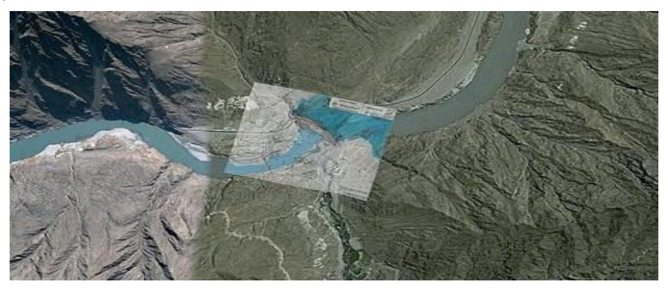
Figure 2. Dam2 site image

Figure 2 ) is located in the Gilgit-Baltistan District of Diamer. It is situated on Indus River, about 315 km upstream of Tarbela Dam, 165 km downstream of Gilgit Capital and 40 km downstream of Chilas District Capital Diamer