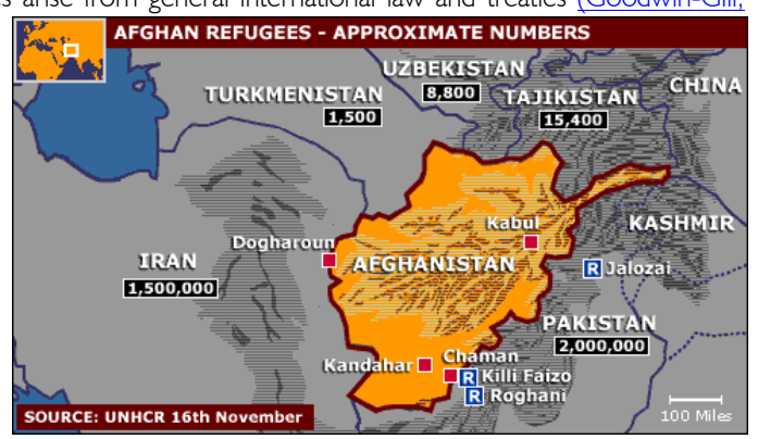
Figure 1: (https://reliefweb.int/map/afghanistan/afghanistan-regional-mapafghan-refugees-neighboring-countries, 2017)

The beginning of the conflict in Afghanistan in late 1970 brought