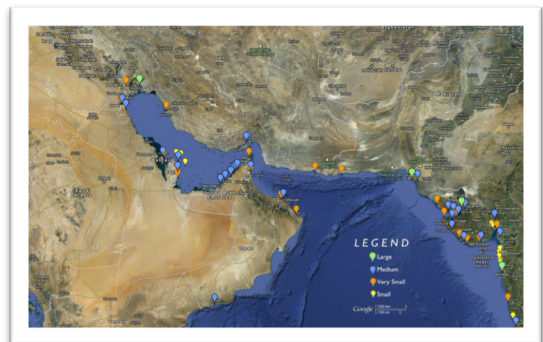
Figure 2: The Ports of the Region