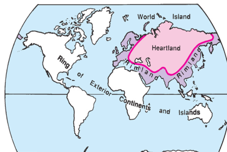
Figure 3: Heartland and Rimland Theories