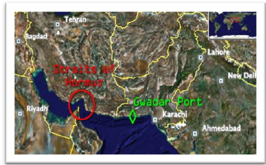
Figure 1: Gwadar Port and Strait of Hormuz

This partnership suggests collaboration between Rimland Theory and Heartland Theory simultaneously in the course to have effectual incorporation of geography between economics and geopolitics. This is basically to implant fresh geographic, political and economic establishments during the planning of GCAP in Central Asia and South Asia. In reality, Heartland theory conceptualizes the entire CARs with portions of Russia and Caucasus as a Heartland, which are basically the mainstay to tenet over the planet. On the other hand, the Rimland theory argues that the controlling authorities of Rimland generally composed of Western Europe, the Middle East and South and East Asia will become certified to be in charge of the planet. Fazl-e-Haider (2015) explains, “Both Heartland and Rimland theories are important but to make it technologically accessible for explanation the reality to advanced world, there is need to attach the economic element while taking into account the spatial attributes of the region under analysis.” Nonetheless, Geo-politics and Geography are lately ended product of International Relations, though single-handedly, these may not elucidate the multifaceted character of the political and economic interdependence.