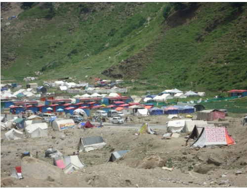
Pl. III: (Kaghan valley, Mansehra): Improper accommodations at Naran