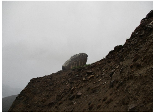
Pl. II: (Kaghan valley, Mansehra): Land sliding