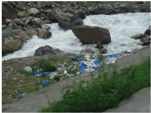
Pl. IV: (Kaghan valley, Mansehra): Garbage thrown along the river