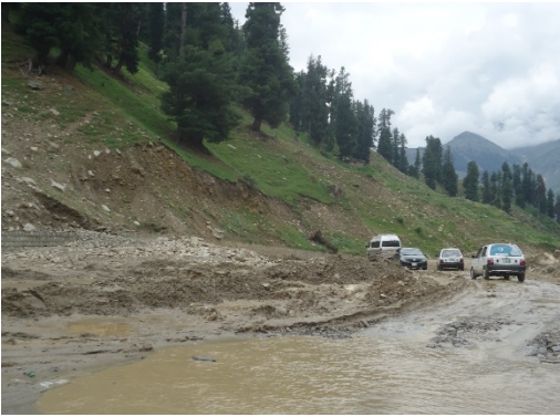
Pl. I: (Kaghan valley, Mansehra): Improper roads