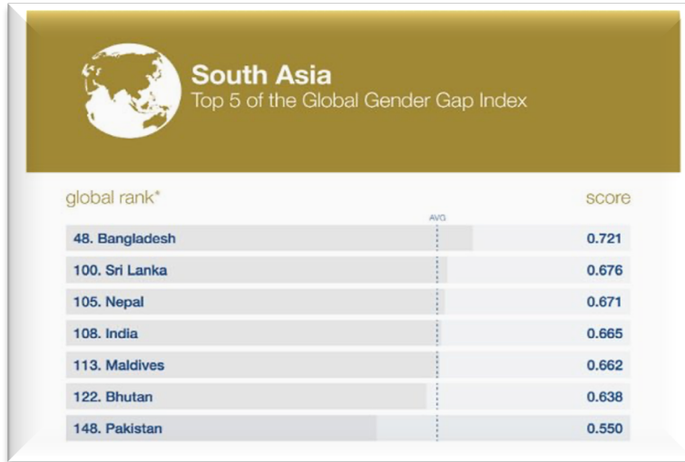
South Asia: UN Women Report shows Worrying Degree of Gender Inequality in Pakistan South Asia Top 5 of the Global Gender Gap Index

2013) and Stevens (2010), writes that gender inequality inversely impacts economy and leads to unbalanced social structure. (Solomon and Memar, 2014) said, without equality sustainable development is unthinkable. All these researches studied about gender discrimination but very few discussed about the causes behind it and almost no study is done to find the role of mothers, how it impacts both male and female in developing a specific thought pattern leading to gender gap.