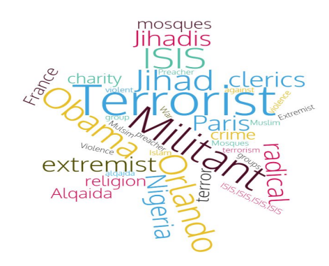
Figure 1: Word cloud of most used words about Muslims in Fox News

A total of 9 news reports in "Fox News Report" and "Fox News Alert" were studied. No program in the "The five" category was found on this incident.