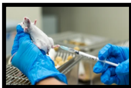
Figure 6: Intraperitoneal injection in lower Abdominal Region

For injecting intraperitoneal injection, the mice should be hold properly that is his head is facing in downward direction and injection is administered in parallel direction in abdominal region that is rich of blood vessel that is third quadrant. In order to check if the injection is properly placed or not the plunger is move back if there is blood on pushing back the plunger then it is not correctly placed. (Engineering, 1994)