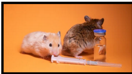
Figure 4: Parenteral administration to mice

The most common animal used in administration of drug is mice so a policy should be followed which promote the positive results and decreases the discomfort of animal. There are certain chemicals which are toxic so their handling as well as route should be determined for better results. The policy had been designed which promote the success of experiment and thing needed to be considered included. Sterility, pH, Physical and chemical characteristics of drug, how many doses we have given to animal etc. Principal investigator basically determined the doses being given to mice and it should be in mg/kg.(Kim, Han, Kim, & Kim, 2010)