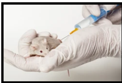
Figure 5: Intramuscular Injection in thigh Muscles

Intra cardiac injection is administered in chest cavity under anesthesia. The needles used for all injection should be small and sterile and one needle should be used for one injection. The number of doses given to mice should be minimum, try to administer only one injection in one day because the analgesic has very limited duration of time. Beside needle the PH plays important role because the injection are directly placed in blood so PH should be neutral because it may lead to serious injury. (Koshkina, Waldrep, Seryshev, Knight, & Gilbert, 1999) The odor and taste are not of much importance because they are injected in blood vessels and that is main advantage of parenteral administration. The solution or vehicle in which drug is diluted should be iso-osmolar that is lactate ringer and should be injected with much attention. Some injectable compounds are potent so they must be diluted by using different vehicles. Similarly, some injectable compounds are in powdered form, so they are also converted to solution by adding vehicle i.e., PBS, DMSO, water, comoil etc. Beside this emphasis should be made on storage and placement because they should be placed in special place in which there is no sunlight because most of them are degraded by direct sunlight.