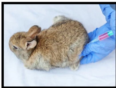
Figure 2: Intramuscular injection in thigh muscles

Here there is no need of general anesthesia, but animal should be restrained properly. This type of injection is common for different antibiotics and sedative drugs. Injection volume here should be 0.5 – 1 ml per site. Needle should be inserted at 90° angle for IM injections. After injection, hands should be washed properly, and gloves should be discarded. (Miyazaki et al., 1995)