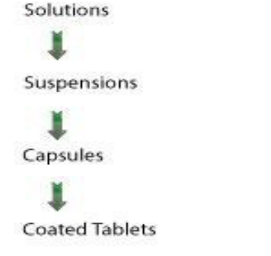
Figure 2: Dissolution of Various Dosage forms

In terms of effective surface area, drug release is determined by particle size and shape of soluble drugs.